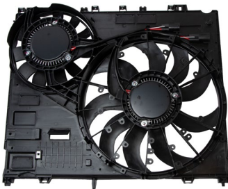
P/N 76411 VIO 171,459 (21-16) Land Rover Range Rover (21-16) Range Rover Sport