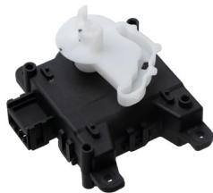
P/N 73607 VIO 424,819 (20-14) Acura MDX