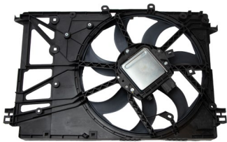
P/N 75336 VIO 404,176 (22) Lexus ES300h (22-19) Toyota Avalon

Four Seasons is pleased to announce the release of seven new cooling fan assemblies with coverage for over 1.2 M+ late model hybrid vehicles.