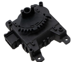
P/N 73609 Mode Main VIO 1.5 M+ (20-14) Acura MDX (21-16) Honda Pilot