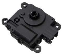
P/N 73610 VIO 3.1 M+ (23-16) Chevrolet Malibu (23-19) RAM 1500

Four Seasons is pleased to announce the release of eight new air door actuators with coverage for over 9.9 M+ late model hybrid/electric vehicle applications.