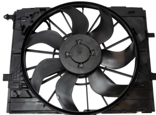
P/N 75331 VIO 209,562 (19-18) Mercedes GLC350e (21-20) E350