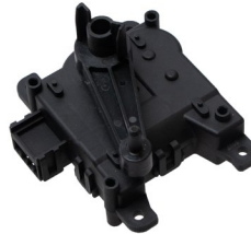
P/N 73608 Mode Auxiliary VIO 1.5 M+ (20-14) Acura MDX (21-16) Honda Pilot