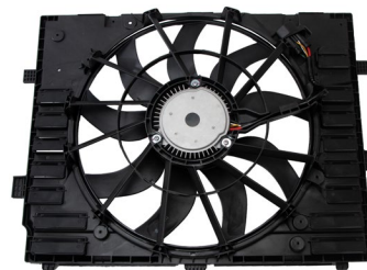
P/N 75329 VIO 102,802 (18-14) Porsche Cayenne