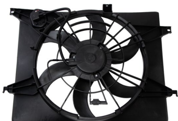
P/N 75408 VIO 44,212 (12-11) Hyundai Sonata