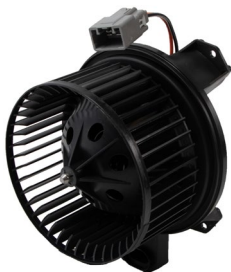
P/N 75169 VIO 383,163 (22-20) Ford Interceptor Utility (22-20) Lincoln Aviator