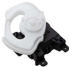
P/N 73596 Recirculation VIO 1.5 M+ (20-14) Acura MDX (21-16) Honda Pilot