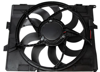
P/N 75321 VIO 203,562 (21-16) BMW 330 Series (20-17) 430 Series