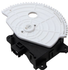
P/N 73598 VIO 276,944 (20-16) Toyota Mirai (16) RAV4