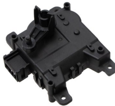
P/N 73606 Blend VIO 1.4 M+ (20-14) Acura MDX (21-16) Honda Pilot