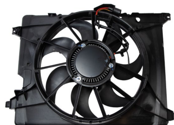
P/N 75415 VIO 133,458 (13-11) Kia Optima (20-17) Genesis G80