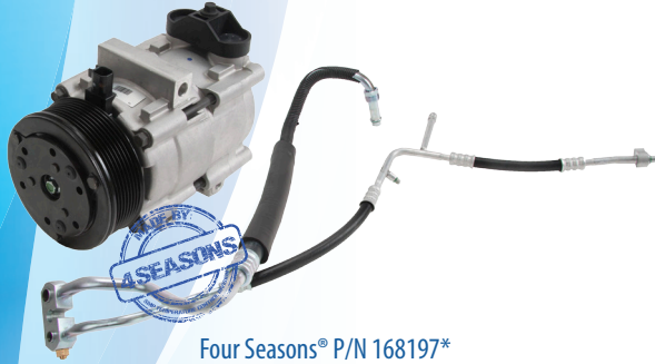
Four Seasons® P/N 168197* (09-04) Ford E-Series 6.0