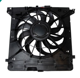
P/N 76169 VIO 1.3M+ (22-20) Ford Interceptor Utility (22-20) Lincoln Aviator