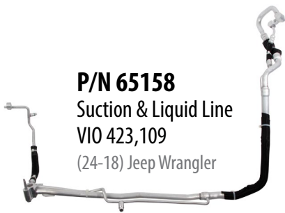
P/N 65158 Suction & Liquid Line VIO 423,109 (24-18) Jeep Wrangler

Four Seasons is pleased to announce the release of eight hose assemblies for hybrid and electric vehicle applications.