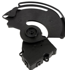
P/N 73655 Air Door Actuator VIO 22,000 (14-03) Chevrolet Silverado Hybrid (14-03) GMC Sierra Hybrid