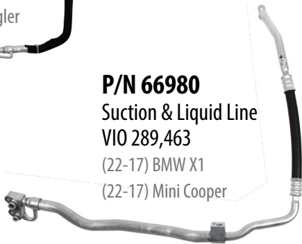
P/N 66980 Suction & Liquid Line VIO 289,463 (22-17) BMW X1 (22-17) Mini Cooper