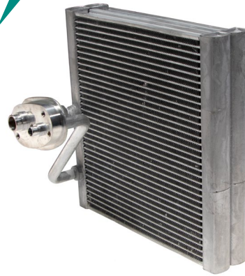
P/N 64180 Evaporator VIO 443,895 (22-19) Volvo S60/S60 Recharge (22-19) V60/V60 Recharge