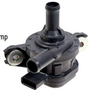
P/N 89088 Electric Coolant Pump VIO 295,286 (17-15) Lexus NX200 (17-16) GS200