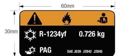
New Underhood Refrigerant Decal