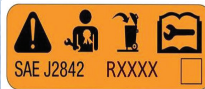
New Evaporator Label

New vehicles using HFO-1234yf Refrigerant, will be marked with these decals: